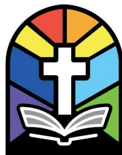
Creswell C of E Infant and Nursery School